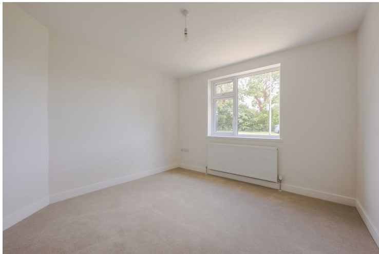
Bedroom three 8'5" x 8'9" (2.59 x 2.68)